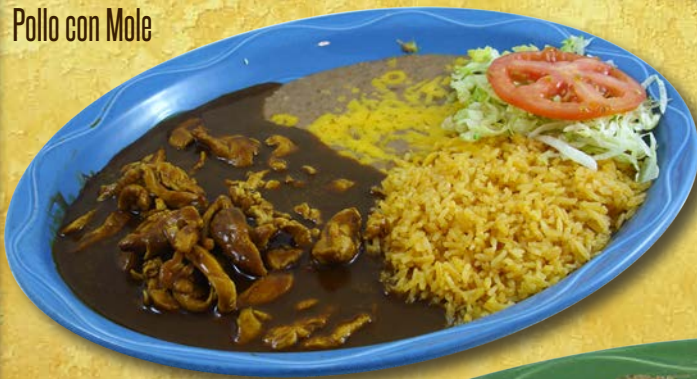
Pollo con Mole