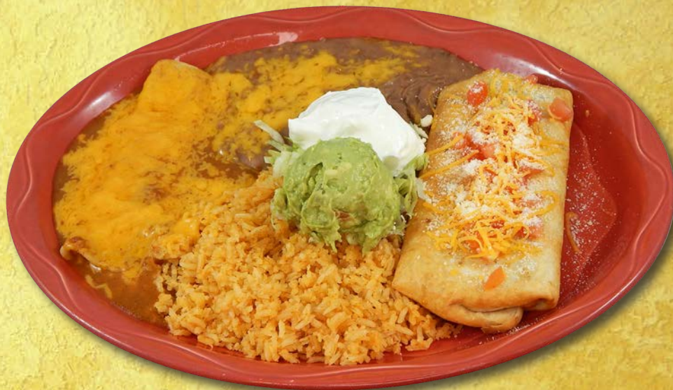
Chimichanga & Enchilada

All combinations served with rice and your choice of refried, black or rancho beans. *Picadillo-shredded beef seasoned lightly with spices.