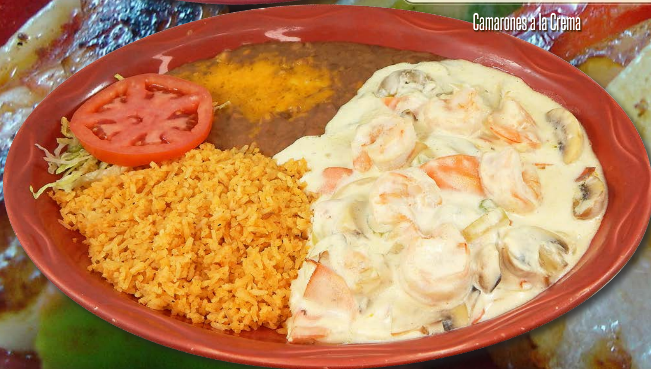
Camarones a la Crema