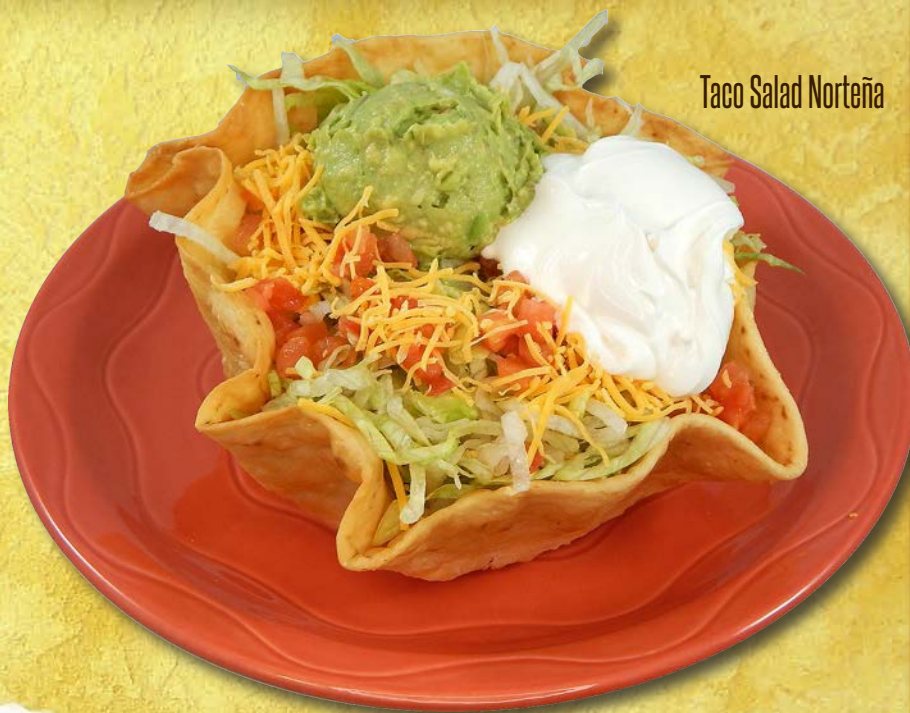
Taco Salad Norteña