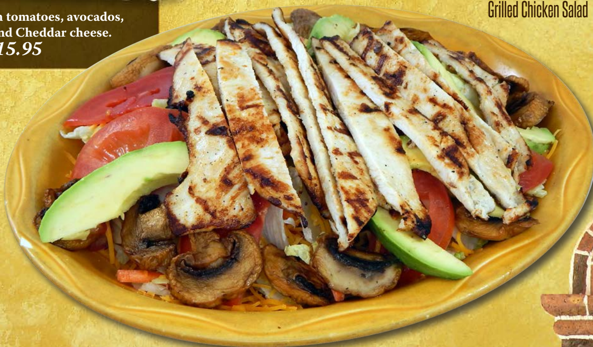
Grilled Chicken Salad