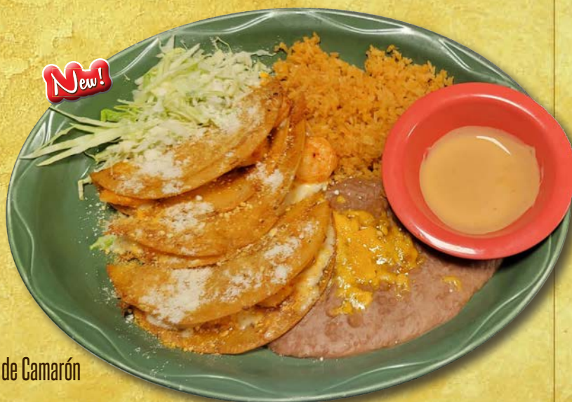
Enchiladas Rancheras de Camarón