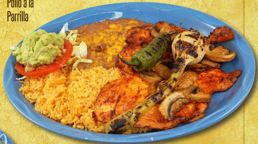
Pollo a la Parrilla