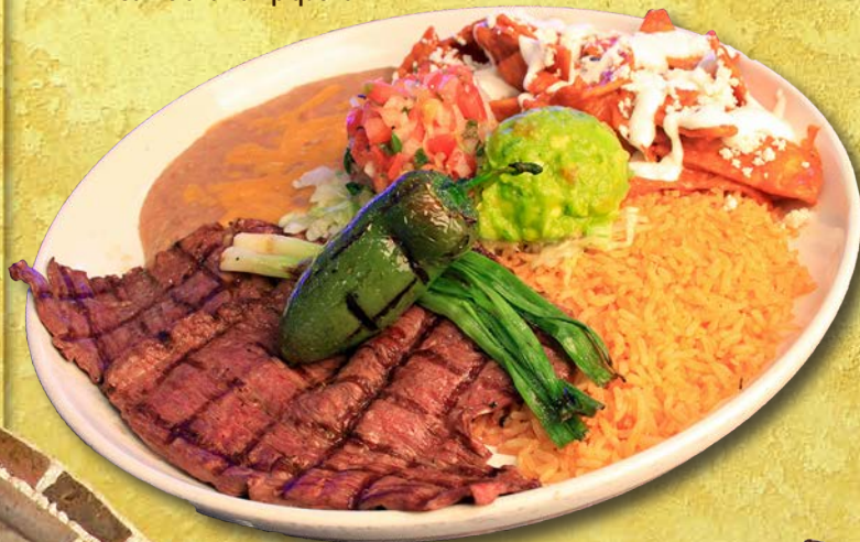
Carne a la Tampiqueña