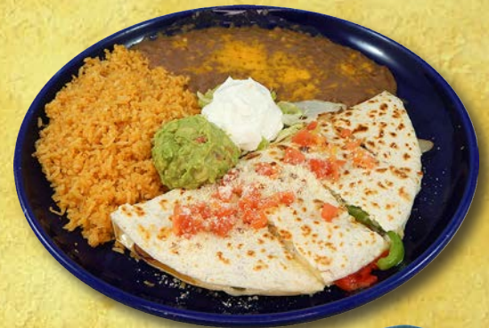
Fajitas de Pollo