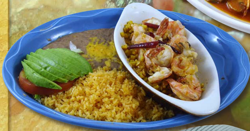
Camarones al Ajillo