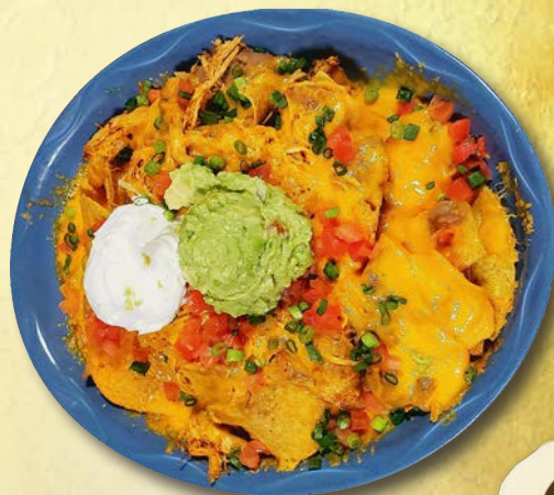
Nachos El Mirador