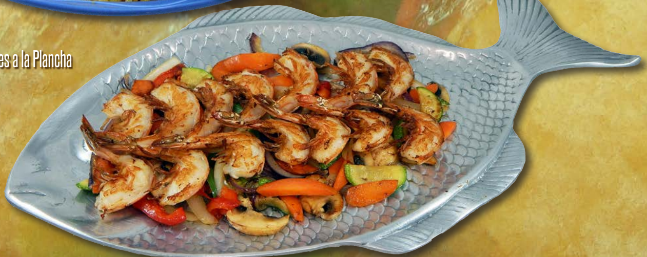
Camarones a la Plancha